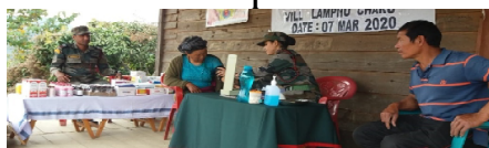
IGAR (South) Imphal/March 8

Chandel Battalion of 26 Sector Assam Rifles under the aegis of HQ IGAR (South) organised a Medical Camp at Lamphou Charu village in Chandel District on yesterday. Keeping in mind the difficulties faced by the villagers due to socio-economic conditions and remoteness of the location, the camp was organised on the request of the villagers as there is no medical facility available in the vicinity. Total 65 villagers including 21 Men, 29 Women and 15 Children attended the camp and were provided with a free